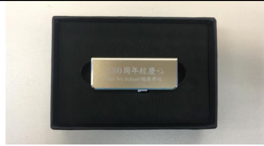
A USB Stick