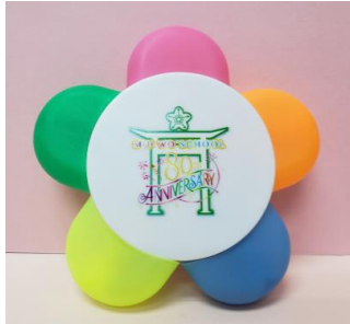
A Five-colour Highlighter