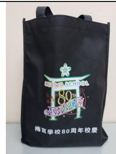
An Eco Bag