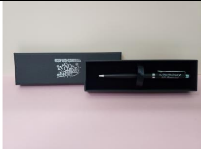
A Signature Pen