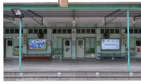
兩塊電子屏幕 Two LED screens were installed on the campus to promote latest news and serve as information source during morning assemblies and recess.