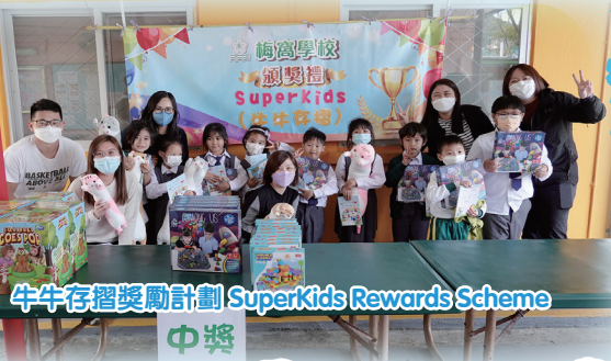
牛牛存摺獎勵計劃 SuperKids Rewards Scheme