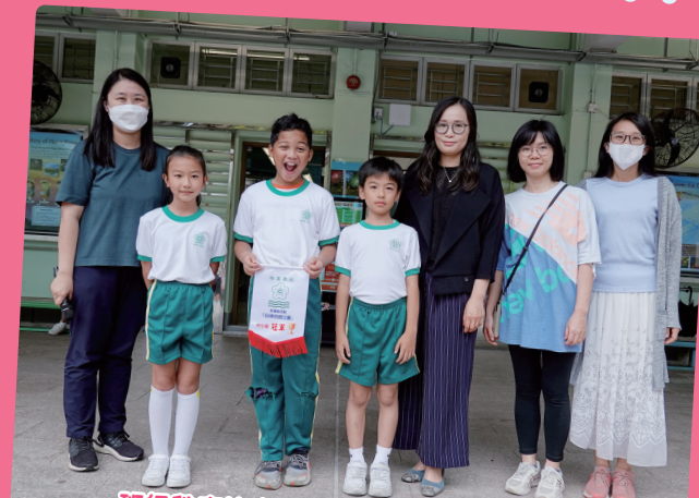
班級秩序比賽 Self-discipline Competition