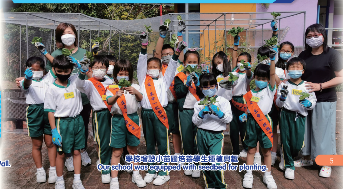
學校增設小苗圃培養學生種植興趣 Our school was equipped with seedbed for planting.