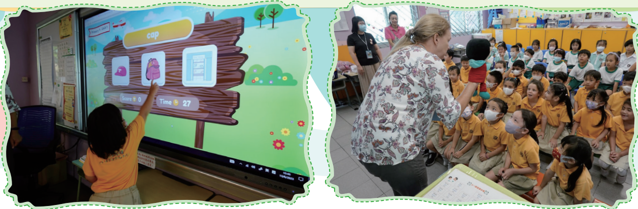
幼稚園生在體驗外籍老師的課堂 Kindergarten students during an English class with the NET

In order to let kindergarten students experience primary school life, each year our School invites young children from the district to attend ice-breaking activities, take part in a school tour, a class experience, cross curriculum games and STEAM activities.