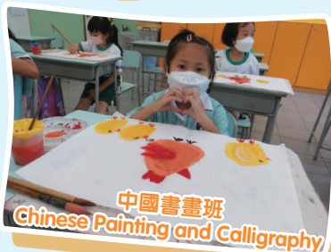
中國書畫班 Chinese Painting and Calligraphy