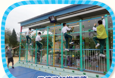
學校增加抱石牆 Our school was equipped Climbing Wall.