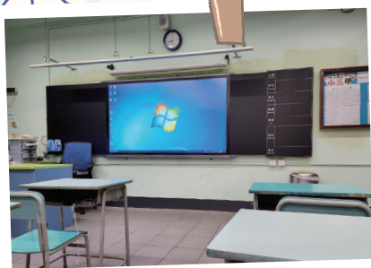
三至六年級及加輔室安裝電子黑板 P.3 to P.6 classrooms and the remedial classroom were equipped with electronic blackboards.

In order to keep pace with the times, our school promotes STEM education and the use of information technology for interactive learning. It actively promotes and teaches eLearning.