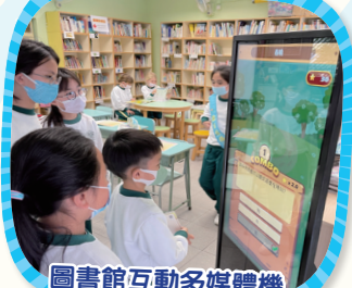
圖書館互動多媒體機 Interactive Library Kiosk