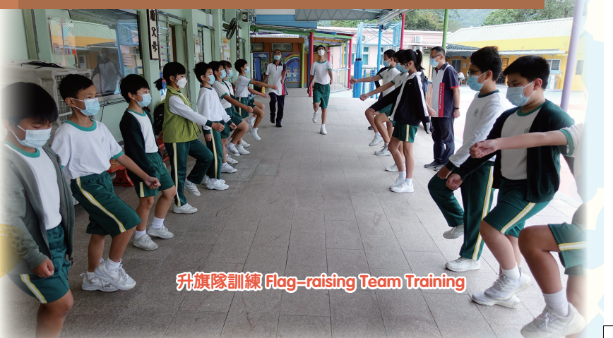
升旗隊訓練 Flag-raising Team Training