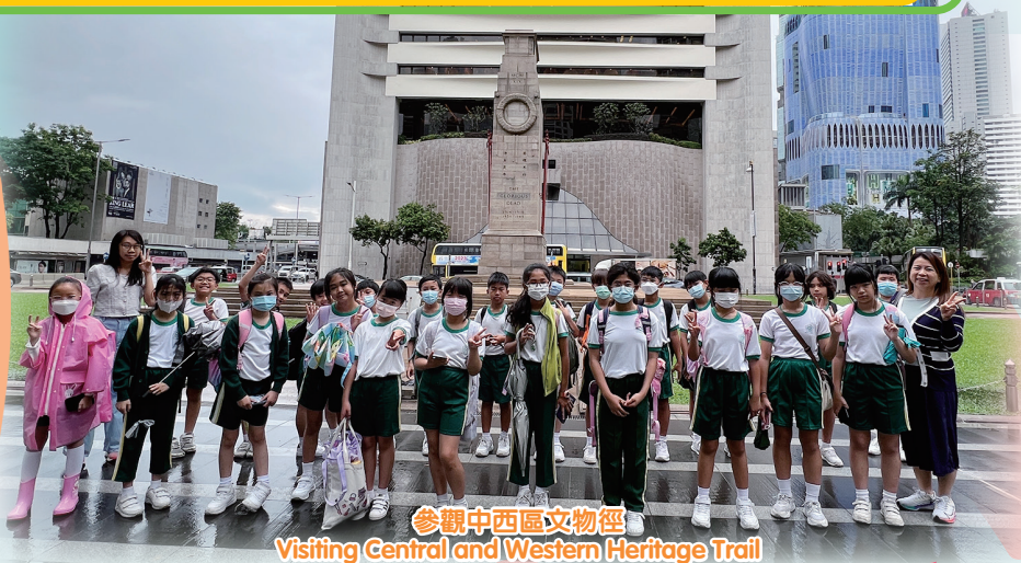
參觀中西區文物徑 Visiting Central and Western Heritage Trail