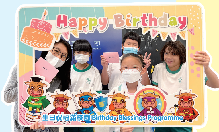
生日祝福滿校園 Birthday Blessings Programme

The school social worker also provides personal guidance services to students in need. The staff work closely with the guidance team to assist teachers with classroom management and discipline issues. It is important to identify students' problems early and provide appropriate support to teachers and pupils.