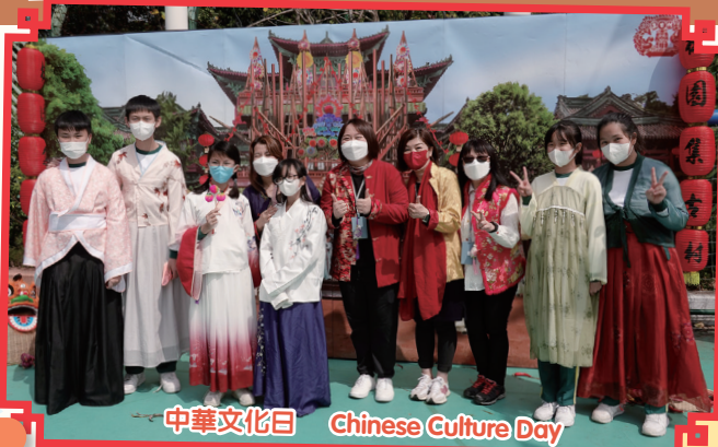
中華文化日 Chinese Culture Day

Apart from instilling positive values and attitudes, running our flag-raising team, organising Chinese Culture Days, as well as participating in the National Day and National Constitution Day Quiz Competitions or related activities, we help our students to further understand our culture and traditions. The school aims at strengthening students sense of belonging and national identity.