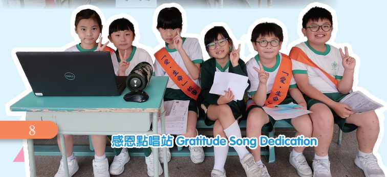
感恩點唱站 Gratitude Song Dedication

輔導組校本輔導主題包括「正向校園」，「和諧校園」和「『抗』大能量『逆』風而上『力』可從心」，駐校社工亦為有需要的學生提供個人輔導服務，以面對成長路上的各項挑戰。