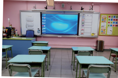
一、二年級安裝電子白板以輔助教學 Recently, our P.1 and P.2 classrooms were equipped with electronic whiteboards.